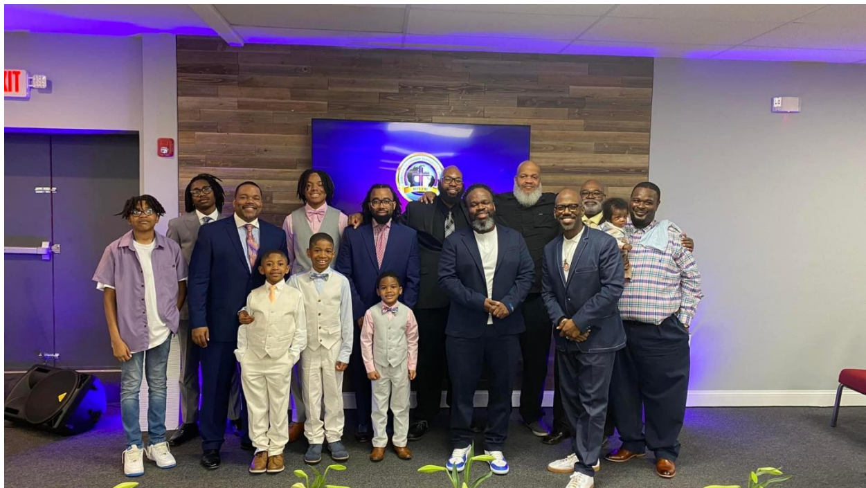
Pictured above: CFEC Men

17) and are loved unconditionally (Jeremiah 31:3). God provides wisdom and direction through His Word and the Holy Spirit (James 1:5; John 14:26), and He promises to meet our needs (Philippians 4:19). Through Jesus, we receive forgiveness and reconciliation (1 John 1:9; Ephesians 1:7), and we are called to unity with Him (2 Peter 1:4; John 17:21). Our relationship with God involves trusting His plans and obeying His commands, knowing that He works for our good (Romans 8:28; John 14:15). Ultimately, God as our Father offers identity, purpose, and belonging, fulfilling our deepest longings and guiding us toward eternal life with Him. Who's Your Daddy?